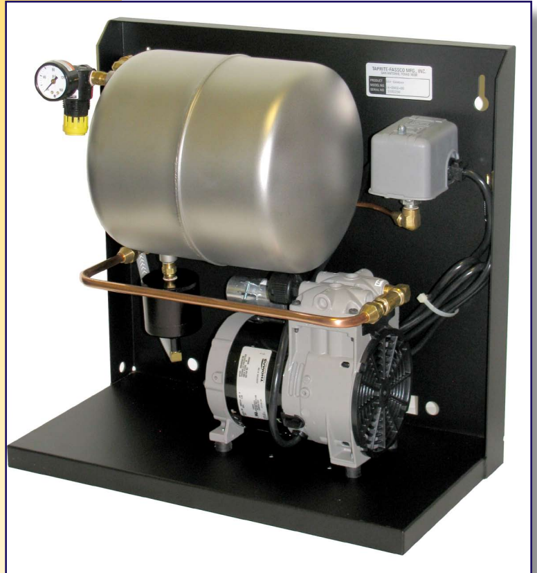
Model CB-100W (with optional Auto Drain)