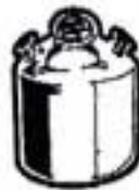
Beer Line Cleaning System