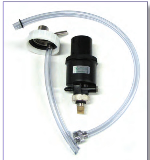
1841 Cleaning Kit