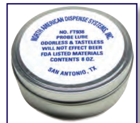
FT938 Probe Lube