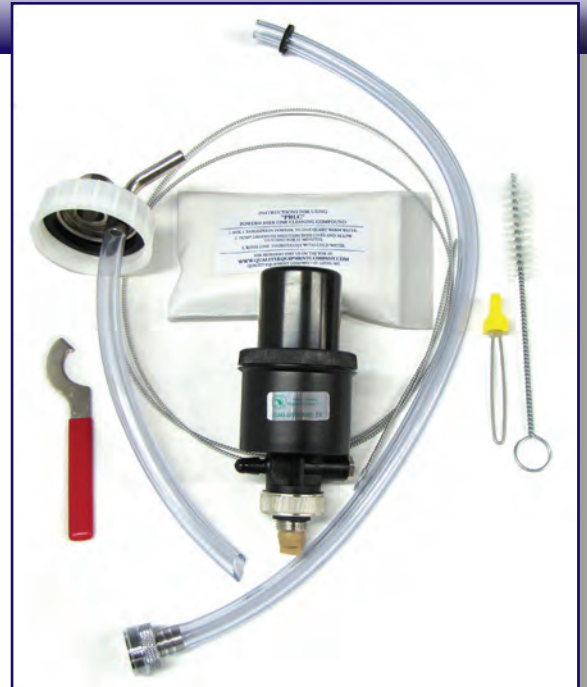
1842 Cleaning Kit