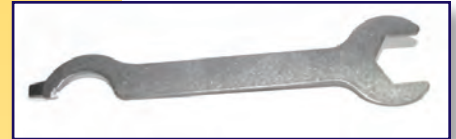
4350S Faucet Wrench