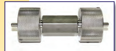
FT110AB Double Flusher